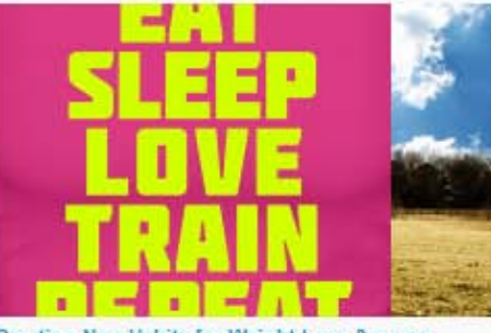
Creating New Habits for Weight Loss Success