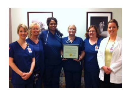
Southeast Alabama Medical Center