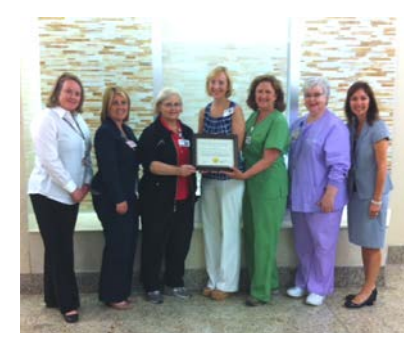
Brookwood Medical Center