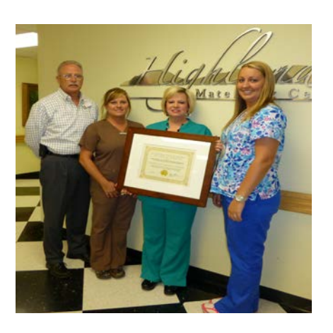
3. Highlands Medical Center