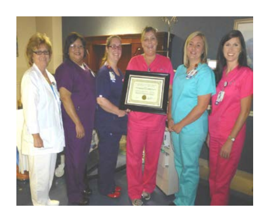
4. Russell Medical Center