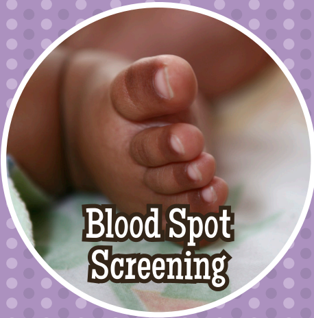
Blood Spot Screening