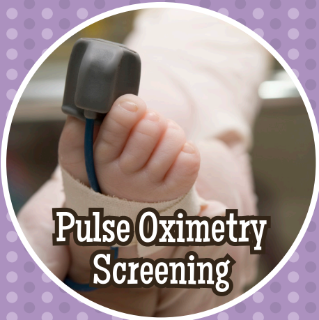
Pulse Oximetry Screening