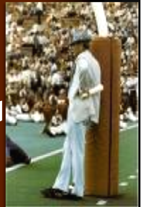
Coach Paul “Bear” Bryant

“To Fail to plan is the greatest moral failure and assures that failure is imminent.”